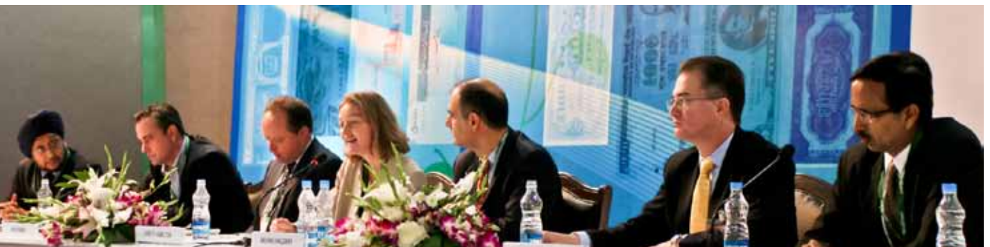
In a session on financing deployment at scale, participants discussed overcoming hurdles to renewable energy growth, such as lack of adequate power infrastructure, unpredictable government support, and the need to redraw financing structures to accommodate the nuances of renewables.

Rajendra Pachauri, Chair, Intergovernmental Panel on Climate Change (IPCC), said he hoped UNFCCC COP 16 would put climate change adaptation "on track" and emphasized that reducing greenhouse gases and incorporating renewables into the energy matrix are crucial for climate change mitigation. He suggested that COP 16 could be useful for advancing progress on identifying appropriate prices for carbon. Energy security, Pachauri added, has a number