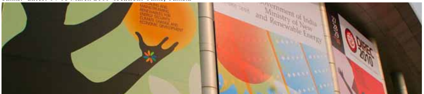
DIREC 2010 banners on display on the outside of the conference center in New Delhi.