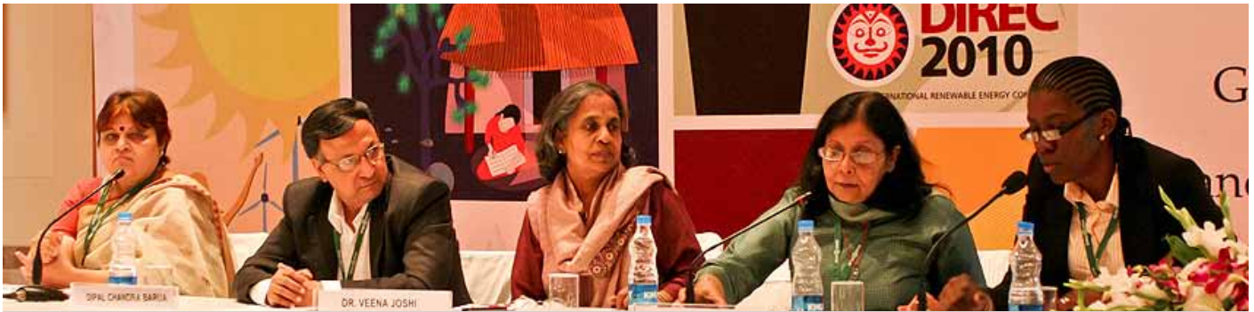
Woman Empowerment: This session discussed the role of women in renewable energy markets, including barriers to obtaining credit, delivery of energy services, and improving household life and health.

standards and overpopulation, which together have led to several mega-trends including: unsustainable energy demands; petro-dictatorships; “global weirding”; energy poverty; and extreme biodiversity devastation. He explained that the universal solution to these problems is abundant, cheap, clean and reliable “electrons” and called on countries to establish ecologies for innovation and to embark on an “earth race” to seek a clean and abundant way to power the world. He added that innovation and technology, coupled with cooperation and competition, are the keys to saving the planet.