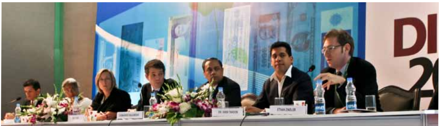
The panel on financing innovation - projects, businesses and technologies discussed the roles for public and private finance, and finance models for supporting innovation.

On power technology and infrastructure, energy and grid integration of renewable energy, reliability of supply, and grid stability and infrastructure were discussed. On heating and cooling technologies, the advantages of district heating