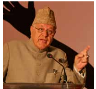
Farooq Abdullah, MNRE, India

Supporting Policies (On-Grid): Panelists called for the removal of trade barriers that keep the cost of renewable energy technologies unnecessarily high. According to some, the creation of sustainable markets for renewables would require a combination of policies, including rules for grid access. Some panelists highlighted national experiences in promoting renewable energy, including in India and Japan.