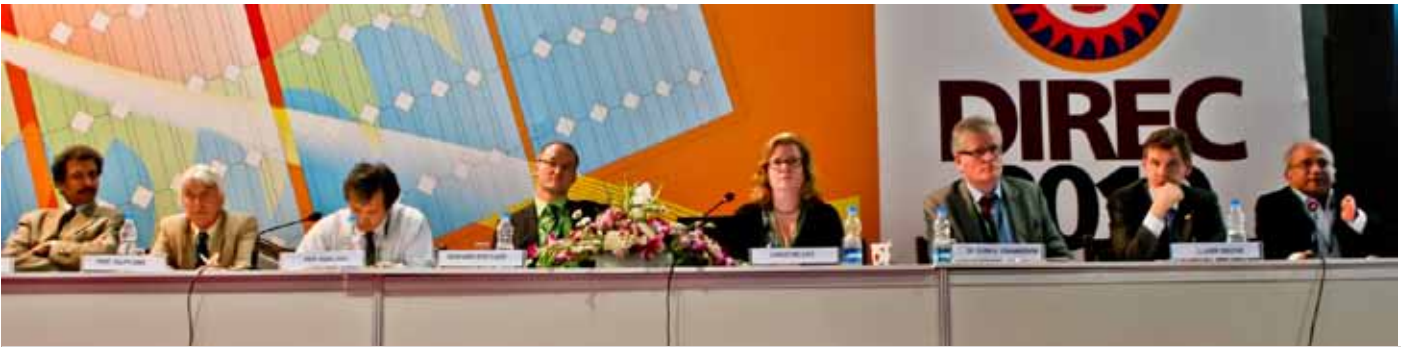
A discussion on heating and cooling technologies focused on markets for solar cooling and heating pumps, policy frameworks for heating and cooling, and product development and market research.

meeting concluded with several recommendations, including the need to: establish a global access fund to target chronic problems of access to energy; develop clear sustainability guidelines and standards for biofuels; strengthen regional research capacities through networks; and establish UN Energy and industry partnerships. IISD RS coverage of the Forum can be found at: http://www.iisd.ca/ymb/energy/greb2009/html/ymbvol128num3e.html