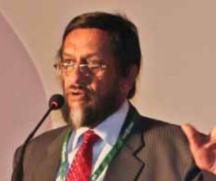
Rajendra K Pachauri, Director-General, The Energy and Resources Institute (TERI) and Chair, Intergovernmental Panel on Climate Change (IPCC)

Renewables in India: This session focused on potentials