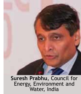
Suresh Prabhu, Council for Energy, Environment and Water, India

The International Renewable Energy Agency (IRENA) was officially established on 26 January 2009. Its purpose is to act as a global clearinghouse of knowledge on renewable energy,