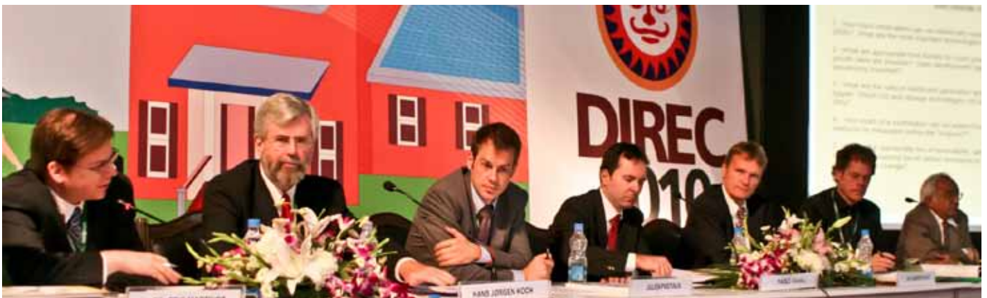
In a session on renewable energy scenarios, participants discussed time frames and costs of various scenarios related to the expected massive transition to renewable energy in the coming decades.