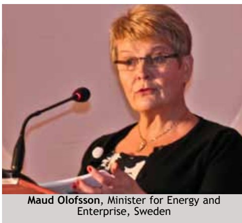
Maud Olofsson, Minister for Energy and Enterprise, Sweden