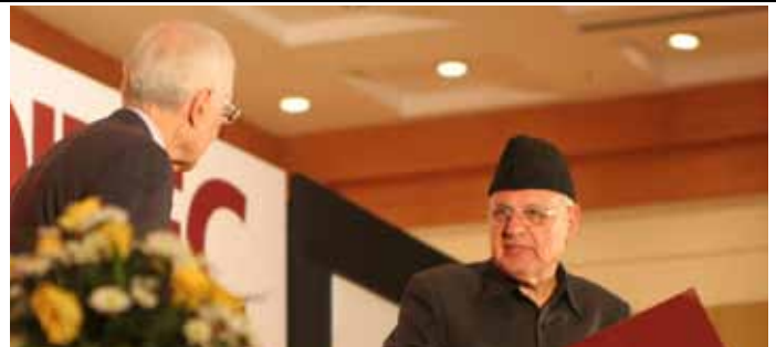
Farooq Abdulla (right), Union Minister, MNRE, India, accepting the DIREC Declaration from Mohamed El-Ashry, REN21.

At UNCED, delegates adopted Agenda 21, an action plan for implementing sustainable development. Agenda 21 addresses sustainable energy, in Chapter 9, on protecting the atmosphere,