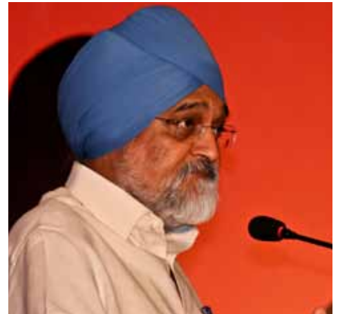
Montek Singh Ahluwalia, Deputy Chairman, Planning Commission, India